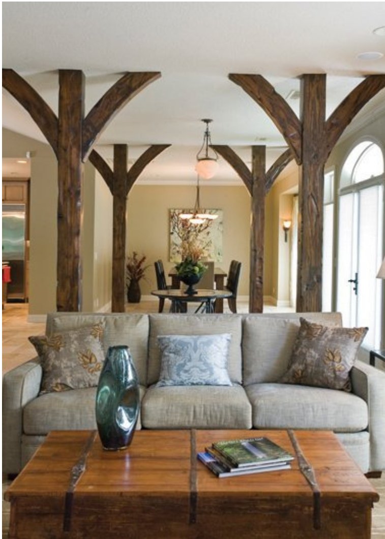
Sitting Room at the Hency Home